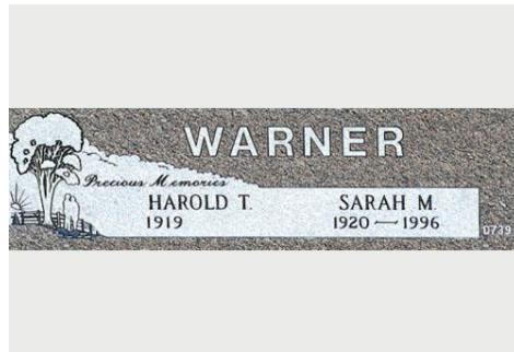
Example of Double Site Companion Marker

Double Site Companion Setting Fee: $450.00