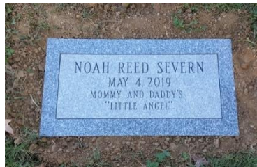
Example of a "Single Flush" marker

Single: 24" W X 12" L Single Setting Fee: $350.00 Cremation: 9 1/2" W X 12" L Cremains Setting Fee: $200