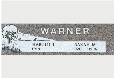
Example of Double Site Companion Marker

Single Site with Companion or Double Depth: No wider than 24" and up to 24" L Single Site Companion Setting Fee: $450.00